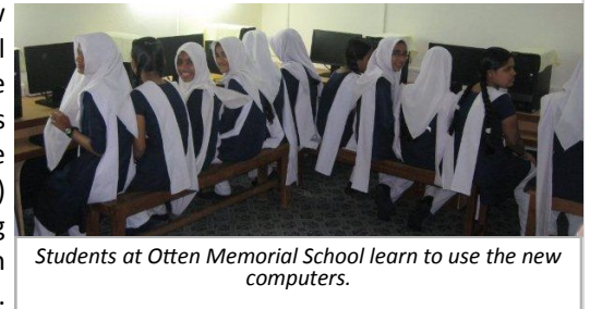
Students at Otten Memorial School learn to use the new computers.

On August 12th I officially inaugurated the new computers in the lab of the Henry Otten Memorial English Medium School in Wandoor by pressing the "Start" button of one of the computers. The computers were provided by the MMS and a special donation. The school has 1,200 students (most of them are Muslims) with 54 teachers and 24 other staff. They are launching a fund raising effort to raise $85,000 to build a much needed additional classroom, auditorium, and offices.