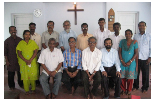
Gospel Workers, October 2010

These plans will give important direction and focus for our work together as MMC and MMS. We pray God's blessings upon these plans, as we remember and celebrate the plan for the salvation of the world which God undertook in His grace when He sent Jesus to be our Savior, "the Lamb of God Who takes away the sin of the world."