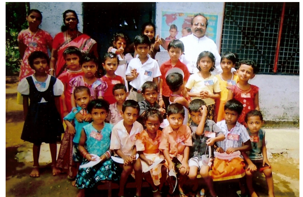
Vacation Bible Schools are very effective evangelistic tools in India