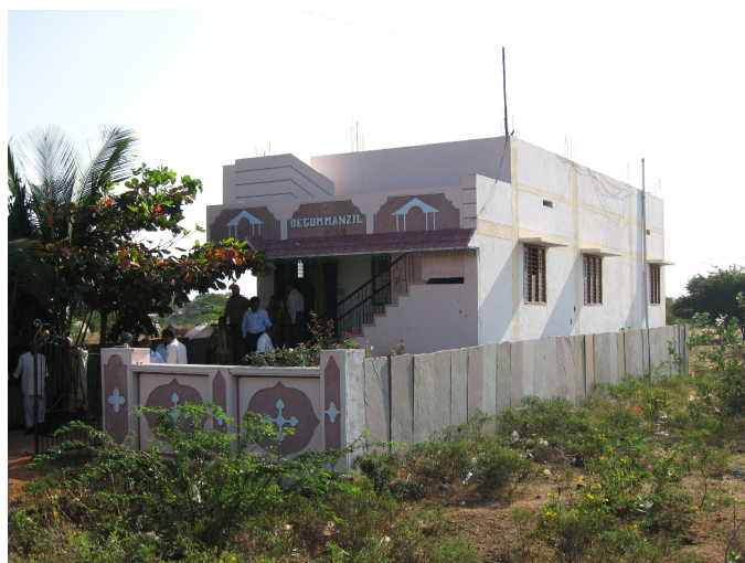
The Gospel for Muslims Ministry headquarters, Begum Manzil , in Uravakonda, a one-hour drive north of Anantapur.

because the Lord has given him a "burden for souls."