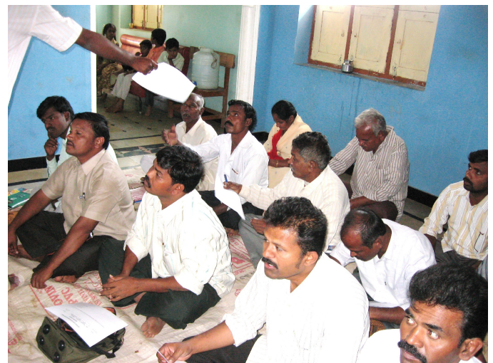
Some of the Gospel for Muslim workers in Uravakonda.

The MMS depends solely upon voluntary donations to support