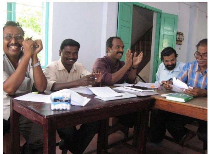
The Gospel Workers of MMC burst into spontaneous applause when the constitution of the MGMS was approved.

societies can work together as sisters and brothers in Christ in India more effectively to bring the Gospel to bear upon the society of India.