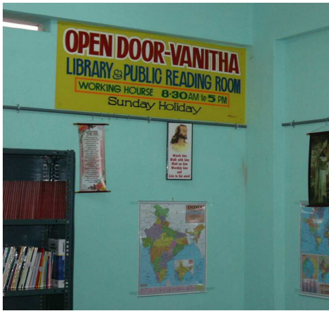
Looking toward the library at The Open Door-Vanitha.

Our regular readers will recall we wrote in our last issue that a pilot project was being considered in Kannur for a student library and reading room for women. This project has now been named "The Open Door-Vanitha." The word vanitha ( vanida ) means women. This is a parallel program to The Open Door, now 2-1/2 years old, with men being the attendees.